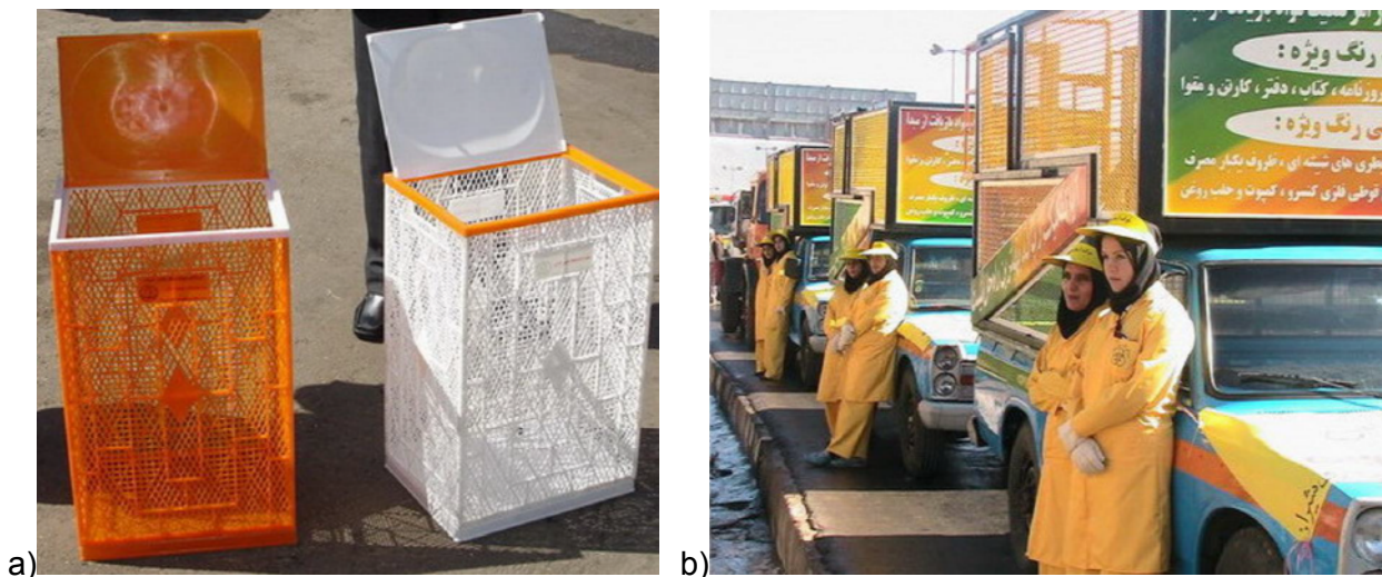
Figure 1 Separation at source at Shiraz: a) Plastic baskets; b) Female personnel at recyclables collection system

Dry waste sorted using the above mentioned bags, is collected every 15 days from doorsteps or by the bins located at the street. This job is carried out by women personals with 28 small and big vans [Fig. 1-b]. With this collection system, 7 tones of recyclables are daily separated at source. The collected material is taken to the recovery station where waste is manually sorted. The sorted materials will be sold to end users or distributors, or they will be sent to the recycling sites directly. 10 tones of hazardous waste and hospital waste are separately landfilled daily. 17 tones of green waste from groceries and fruit markets are collected by a special collection system everyday. Collected green waste is Vermi-composted in a site close to the landfill. The remaining 780 tones of the waste are collected each day either from doorsteps as wet/mixed waste or from the streets. The collected mixed MSW is transported to a landfill equipped with a biogas collection system [3].