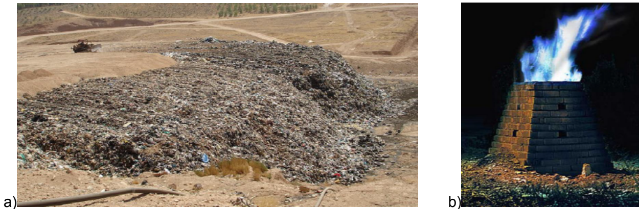
Figure 4 Shiraz Landfill: a) Daily covering and gas collection pipes; b) Biogas burning wells

located in North of Iran, close to the Caspian Sea where the weather is highly humid and the high rate of humidity content of the MSW makes its treatment more difficult. A MBT system similar to the one explained earlier in this paper has been running in this plant for more than two years [Fig. 5].