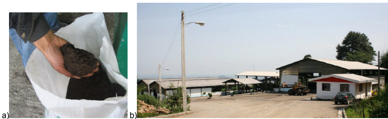
Figure 5 Babol composting Plant: a) Fine compost Produced at BCP; b) BCP site close to city of Babol in Northern Iran

The MBT plant in Shiraz will be a modified version of the current MBT plant in Babol thanks to the company's practical experiences in Iran and the new advanced technologies in waste management industry in the world.